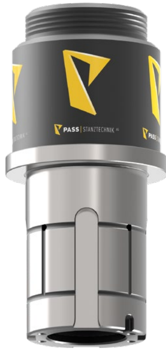
ps:®basic guide assembly